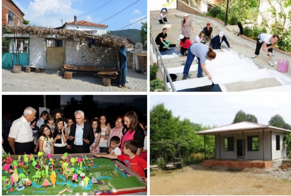
Figure 2 Photos of some DIY Urbanism and Co-production Examples in Turkey

with co-production. Overall, the first group of examples (%70) are more than the second group (%30).