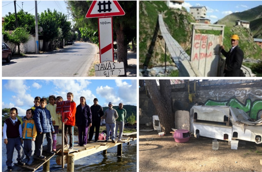
Figure 4 Photos of some other DIY Urbanism and Co-production Examples in Turkey

they presented it as 'formal' by organizing an "opening ceremony" in which they gave a name to the bridge meaning "10 Houses Bridge", put a signboard in its entrance and cut a ribbon to celebrate its construction (cutting a ribbon is a tradition in formal opening ceremonies in Turkey). Their aim was to protest the lack of attention of the formal authorities and to point out their need of an enduring bridge. However, the results of this attempt were also negative. After a while of ignorance, the bridge was demolished because of bad weather conditions.